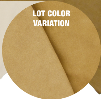
LOT COLOR VARIATION

F: Irregular color shades found within hides and/or within a panel characterized by raised surface and inconsistent grain.