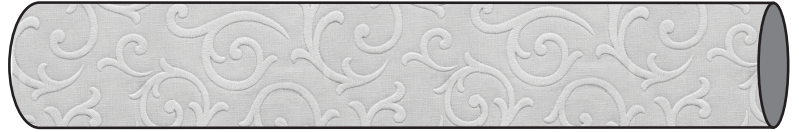
Direction of pattern on gaufrage roll. Not to scale.