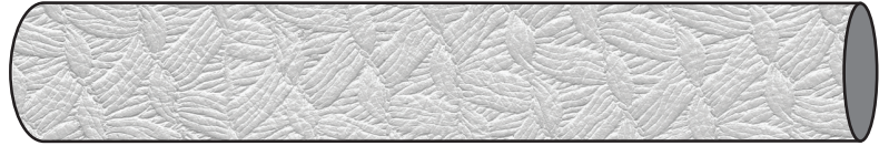
Direction of pattern on gaufrage roll. Not to scale.