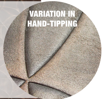
VARIATION IN HAND-TIPPING

A: Leather is a natural product and it may take the embossing effect differently from area to area and therefore, there will be some variation in the depth of the embossed pattern print. This variation is controlled as much as possible.