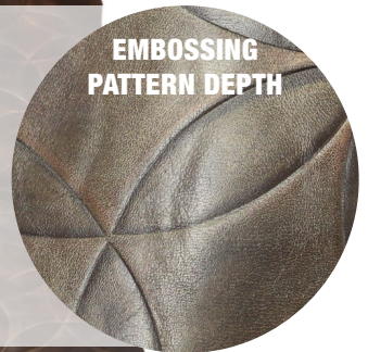
EMBOSSING PATTERN DEPTH

A: Leather is a natural product and it may take the embossing effect differently from area to area and therefore, there will be some variation in the depth of the embossed pattern print. This variation is controlled as much as possible.