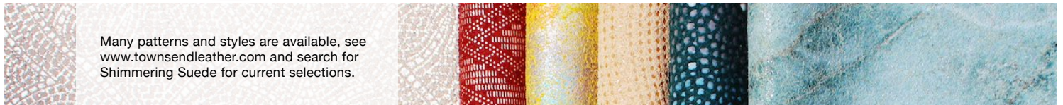
SUEDE DOUBLE BUTT

Many patterns and styles are available, see www.townsendleather.com and search for Shimmering Suede for current selections.