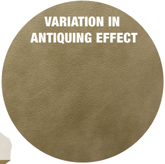
VARIATION IN ANTIQUING EFFECT