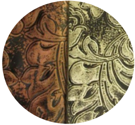
LA SCALA DAMASK