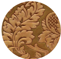
LA SCALA DAMASK