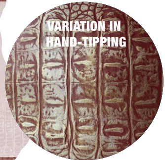
VARIATION IN HAND-TIPPING

B: Leather is a natural product, therefore it may take the embossing effect differently from area to area and therefore, there will be some variation in the depth of the embossed pattern print. This variation is controlled as much as possible.