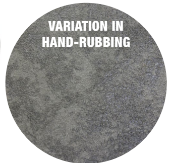
VARIATION IN HAND-RUBBING