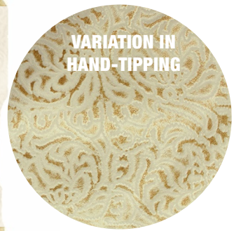
VARIATION IN HAND-TIPPING

A: Gaufrage Brushed Metallic is an Aniline leather, with no consistent surface pigments; there will be natural color shading within a hide and from hide to hide.