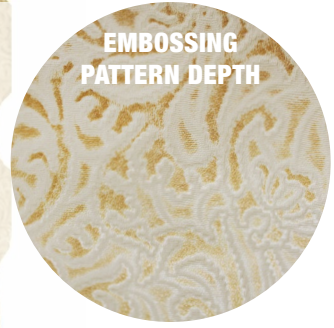
EMBOSSING PATTERN DEPTH