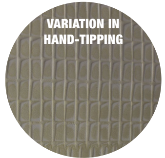
VARIATION IN HAND-TIPPING