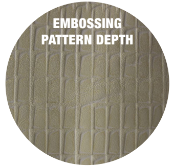
EMBOSSING PATTERN DEPTH