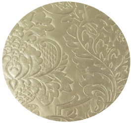
LA SCALA DAMASK