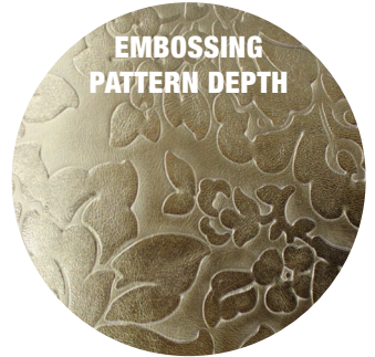
EMBOSSING PATTERN DEPTH

B: Fab Foils Embossed defects may include natural characteristics such as small holes, crease lines, and discoloration spots. These defects are minimal but should be expected to some degree as this is a natural product.