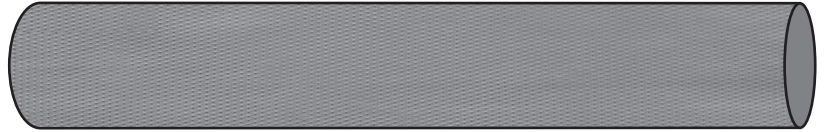
Direction of pattern on gaufrage roll. Not to scale.