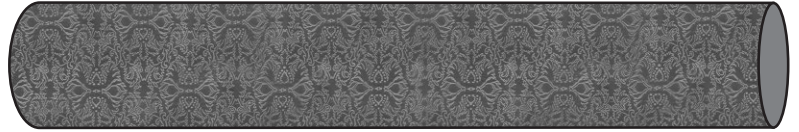
Direction of pattern on gaufrage roll. Not to scale.