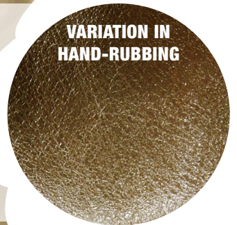
VARIATION IN HAND-RUBBING